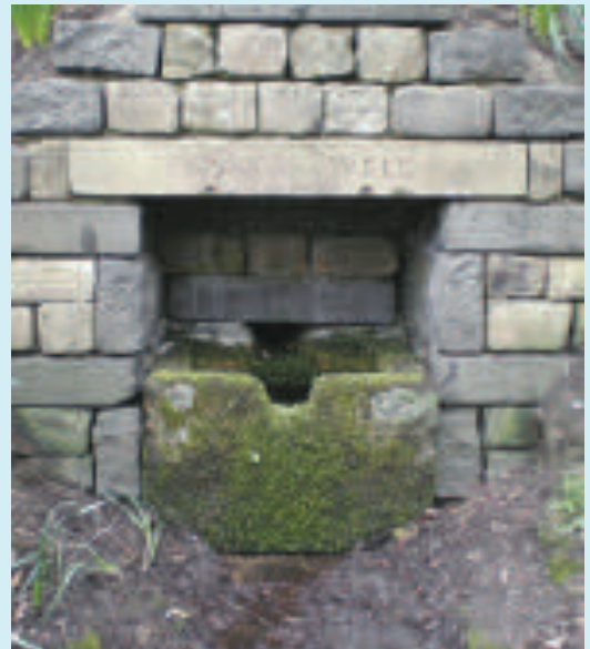
Above right: Spinkwell. Below: Bradford Beck alongside Canal Road. Below right: Bradford Beck near Shipley.